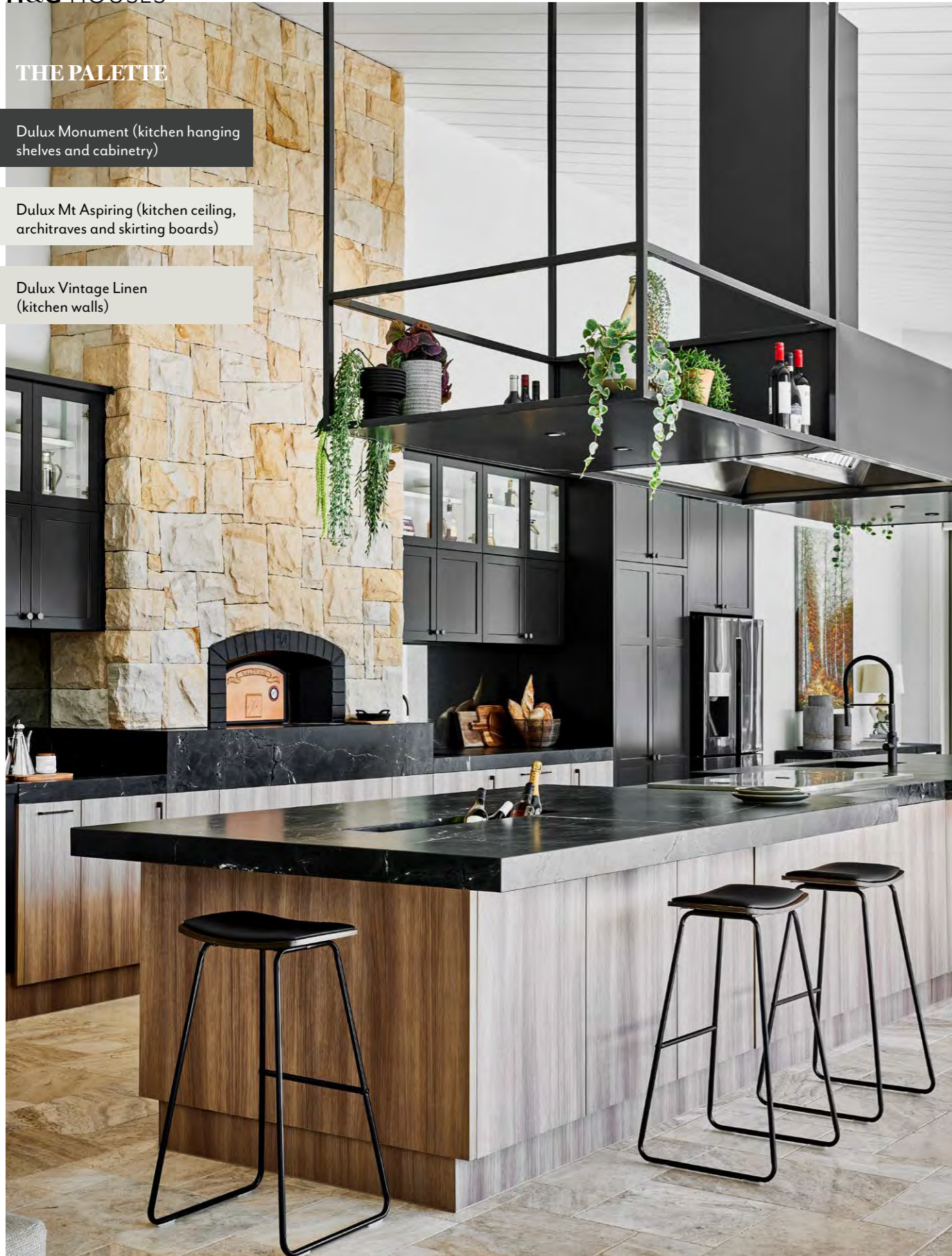
Paint colours are reproduced as accurately as printing processes allow.